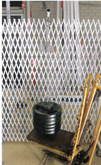
Figure 1: Simulated Climbing Test