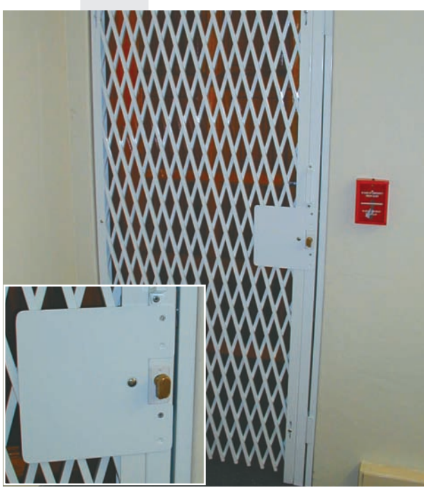
Double Diamond Door: Snib Turn Egress Key Turn Access